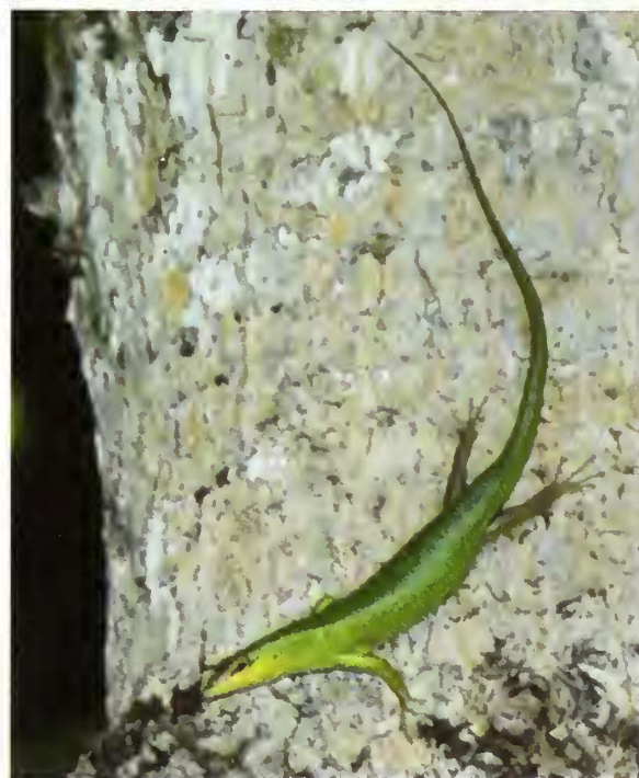
Fig. 13. Lamprolepis smaragdina ssp. from Salibabu Island.

Additional material: ZMA 11304 (1 spec.), Karakelang (= Karakelong), coll. H. J. LAM 1926; ZMA 18231 (1 spec.), Liroeng (= Lirung), Salibabu, coll. H. J. LAM 1926.